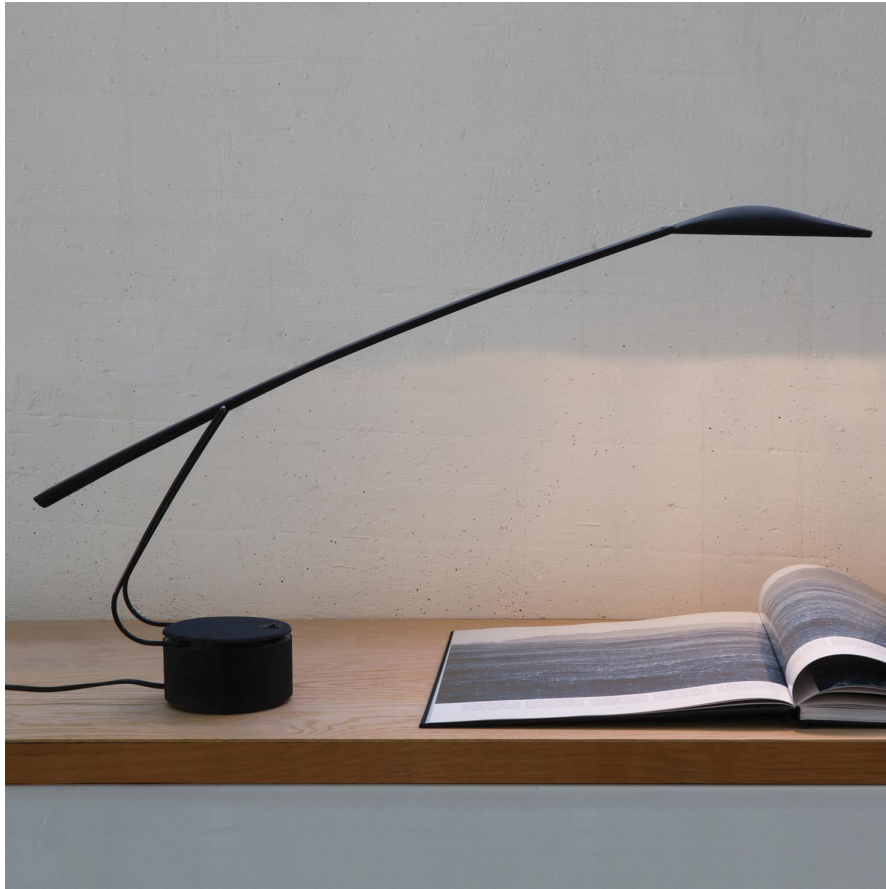
Table light with medium-flood beam, ideal as a task or as a reading light. Body in polycarbonate, arm supports in molibdenum steel. Painted in matt black. Double intensity switch.