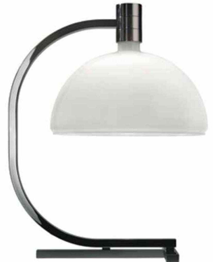
TABLE E27 FLUO/LED/HALO