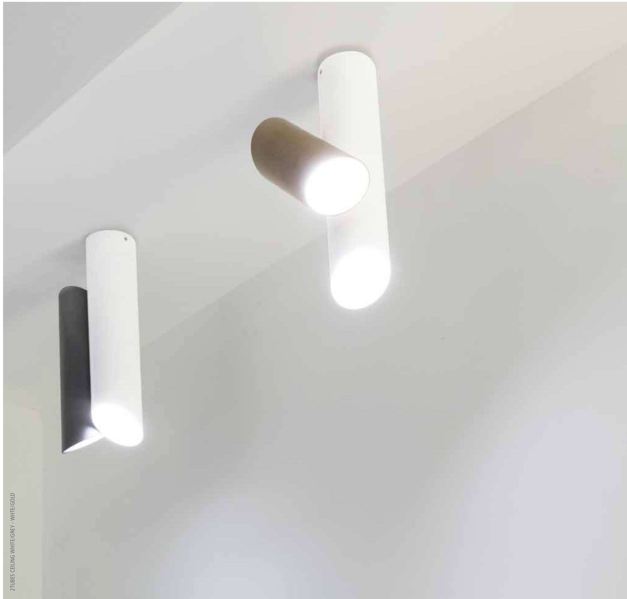
2TUBES CEILING WHITE/GREY - WHITE/GOLD