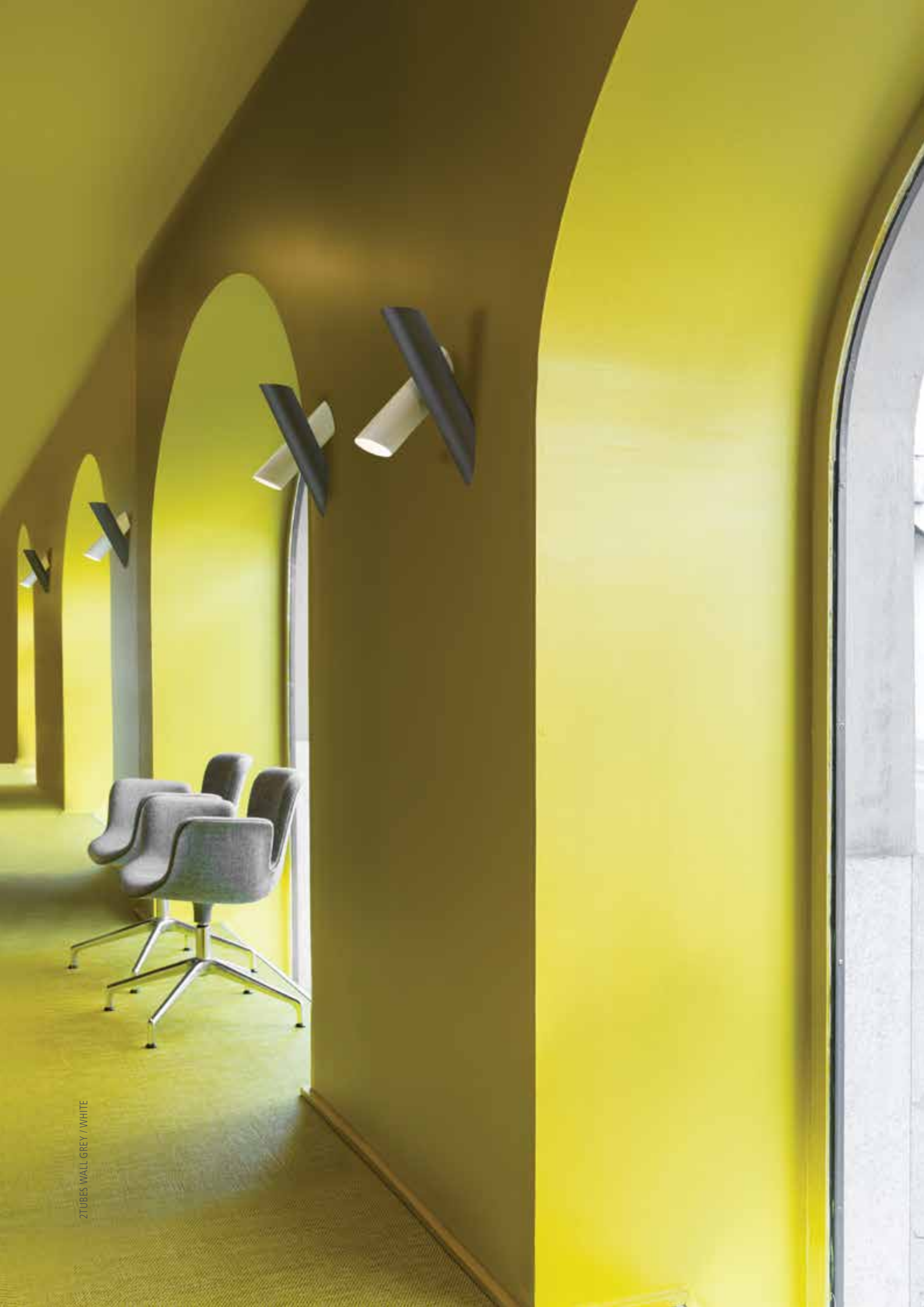
2TUBES WALL GREY / WHITE